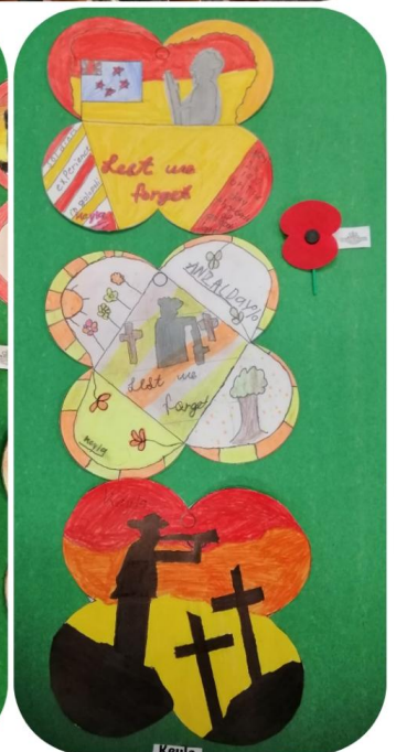
Anzac Day Art works by Team Whakatere